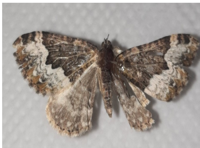
Fig. 4. Euphyia biangulata (Haworth, 1809), collected by PB in Rapçë, 08 July 2021

The geometrid moths are the only lepidopteran family with a recent checklist for Kosovo considering all available literature as well as new records (Bytyçi et al., 2022). Accordingly, E. biangulata is added to the list of Geometridae of Kosovo, and with this species the number of geometrid species in the country is 248. Considering the size of Kosovo, the number of 248 geometrid species can be considered a high number, however comparing to the other Balkan countries, Serbia 390 species (Stojanovic, 2010), Croatia 440 (Mihoci 2008), Bulgaria 442, and the European part of Turkey 200 species (Okyar & Mironov, 2008), it can be expected the number of geometrid species in Kosovo to increase with further research.