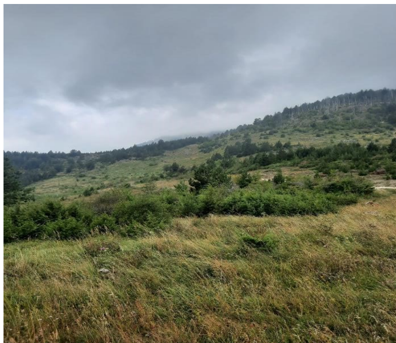
Fig. 2. Habitat of Euphyia biangulata at the locality Rapçë (1214 m), photograph by PB, 08 July 2021.