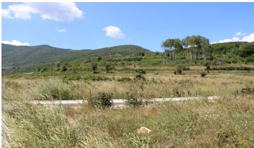
Fig. 3. Habitat of Euphyia biangulata at the locality Brezne (1064 m), photograph by PB, 23 July 2022.