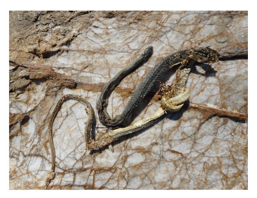
Fig. 2. Specimen of Dolichophis caspius found on Kitriani Islet.

During our research on 13 August 2022, one dead specimen of European whip snake, Dolichophis caspius (Gmelin, 1789) was found near the coast of Kitriani (36°54'10"N - 24°43'40"E, 36 m; Fig. 2). The European whip snake is present on Sifnos and is one of the most common snake species in the Aegean islands (Cattaneo, 2010; Cattaneo et al., 2020, 2023). Several hypotheses could be made about the presence of D. caspius on Kitriani. It could be the consequence of passive translocation, of active dispersal or it could be indigenous to the island. The occurrence of Podarcis erhardii and the authors' finding of remnants of bones of Rattus rattus on Kitriani are indicators of the presence of trophic sources suitable for the survival of this species. It is worth noting that the found specimen appeared "knotted", a posture that snakes sometimes assume during predation or as a result of various pathologies, or it could be the consequence of a transport to the island by a scavenger bird or raptor.