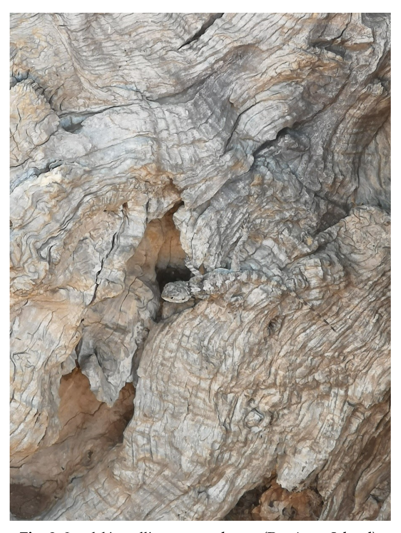
Fig. 3. Laudakia stellio on a carob tree (Pserimos Island).

In addition to this species, several individuals of Ophisops elegans were observed and two exuviae were found, one of Eirenis modestus (17 dorsals, 167 ventrals, more than 25 pairs of subcaudals) and one of Telescopus fallax (19 dorsals, about 220 ventrals, 69 pairs of subcaudals). As for T. fallax, the Kalymnos population also seems to exhibit very high values in the number of ventral scales (over 220); this claim is based on the number detected on another exuvia found in Kalymnos a few days later, as well as previous data reported by the third author (Cattaneo, 2010). As a rule, in the nominal subspecies that inhabits the other Aegean islands, it seems that the ventral scales values stay well below 220 scales. Both E. modestus and T. fallax are also well represented on the mother island of Kalymnos.