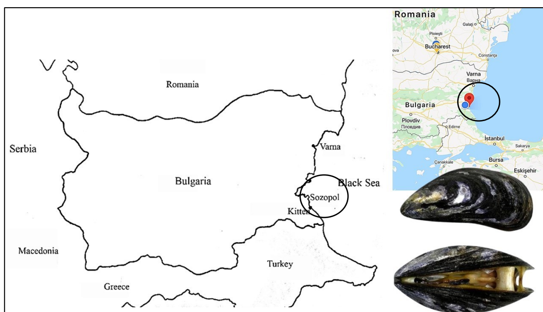
Fig. 1. Geographical location of the town of Sozopol in Bulgaria.

In this short note, we aim to present new results on stress on stress response measurements in both farmed and wild Mediterranean mussels from the town of Sozopol, Bulgaria, collected in the summer of 2024 (August). In addition, we further aim to see if there are seasonal fluctuations, as we already presented results for this rapid, simple, and low-cost biomarker for mussels collected in the winter (January) and spring (April) of 2024 (Yancheva et al. 2024a,b).