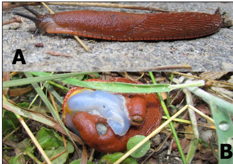
Fig. 2. A. vulgaris : A – external view of crawling specimen, B – copulating specimens (Plachkovtsi village, Stara Planina Mts).