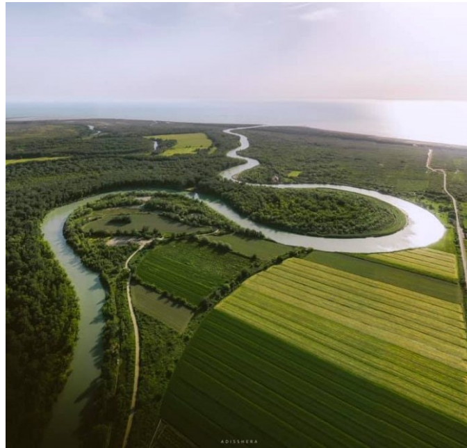
Fig. 1. Flow of the Shkumbini River in Bashtova